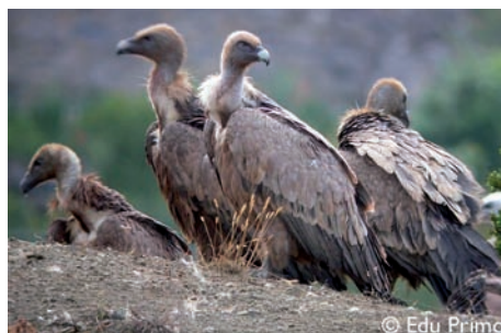
Conservation status of Pyrenean vultures

From 2009 to 2012, the Pyrenean valleys of Navarra, the district of the Hoya de Huesca, and the Ossau Valley have developed an environmental awareness initiative around these species: VULTOURIS, rooted in a set of touristic and educational resources intended for a diverse range of visitors.