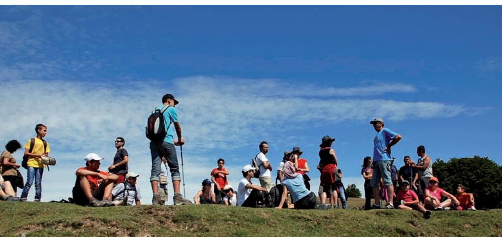
Route through Abodi (Navarra)