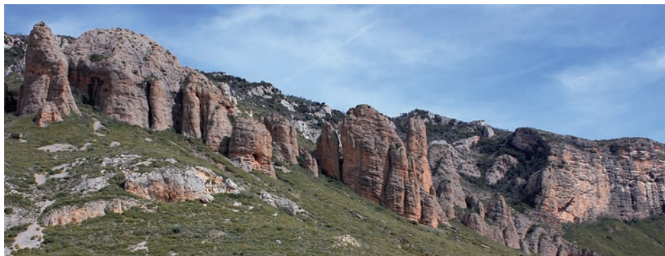
Route through the Mallos de Riglos (Huesca)

Covering terrain on both sides of the crest of the Pyrenees, in the Communities of Aragon (Huesca) and Navarra in Spain and in the Ossau Valley of France, it's a transition zone exhibiting a great variety of landscapes and unique conditions that allow for exceptional diversity.