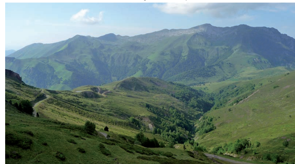
Route through the Col d'Aubisque: Boucle Soum de Grum. Vallée d'Ossau

All information on the project, resources and activities available at: www.vultouris.net